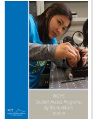
WICHE Student Access Programs: By the Numbers 2018-19